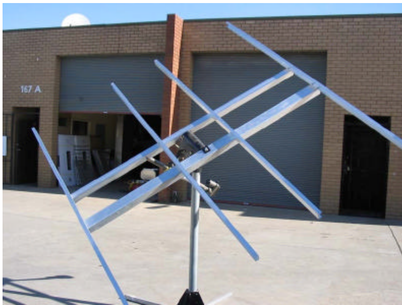
Portable version ST-8

Aluminium frame bundle 2166x150x100mm Carton box 450x450x200mm with Polar mount, Assembling bolts and nuts Carton box 900mmx230mmx160mm with: heavy duty actuator 24-inch Tracking controller STU-48 Assembling instruction Gross weight 42kg Mounting pole is optional